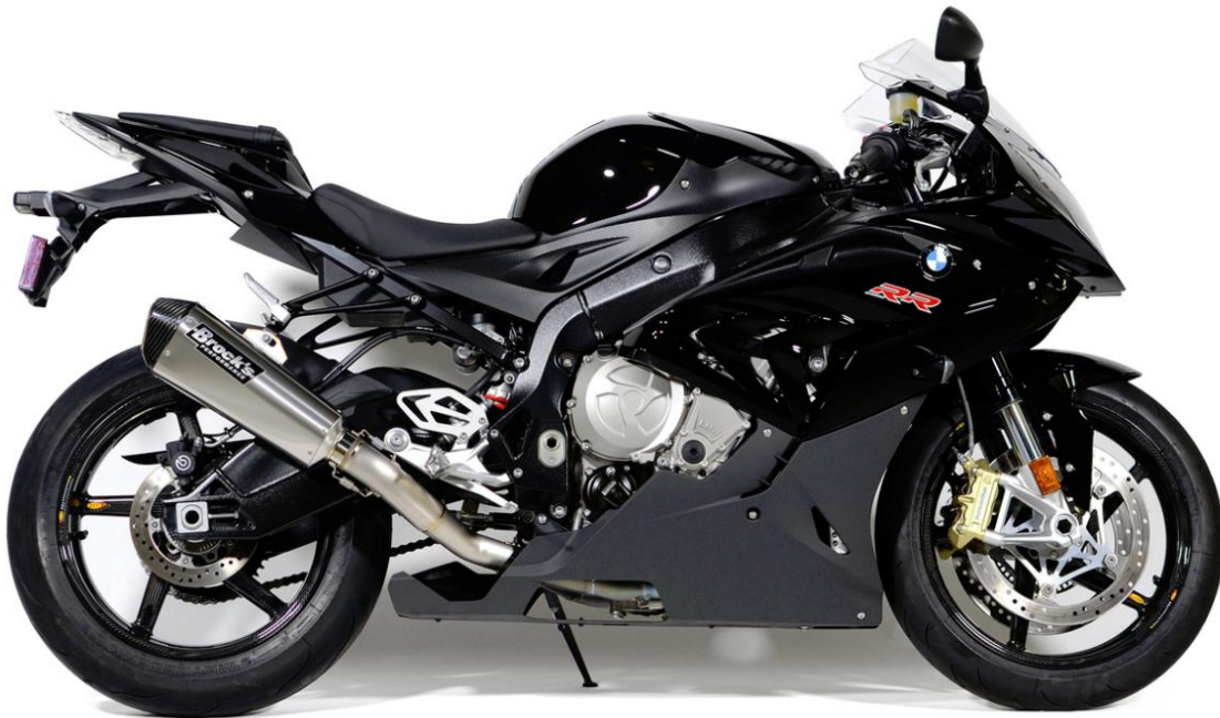
**CT Single Shown**

Warranty Info: The PAIR system must be blocked off in order to prevent premature exhaust failure. Please refer to the PAIR Block Off Cap instructions. They can be found at BrocksPerformance.com