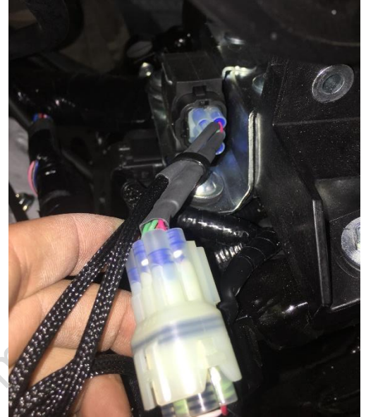
Fig1. Harness in Tip Over Sensor