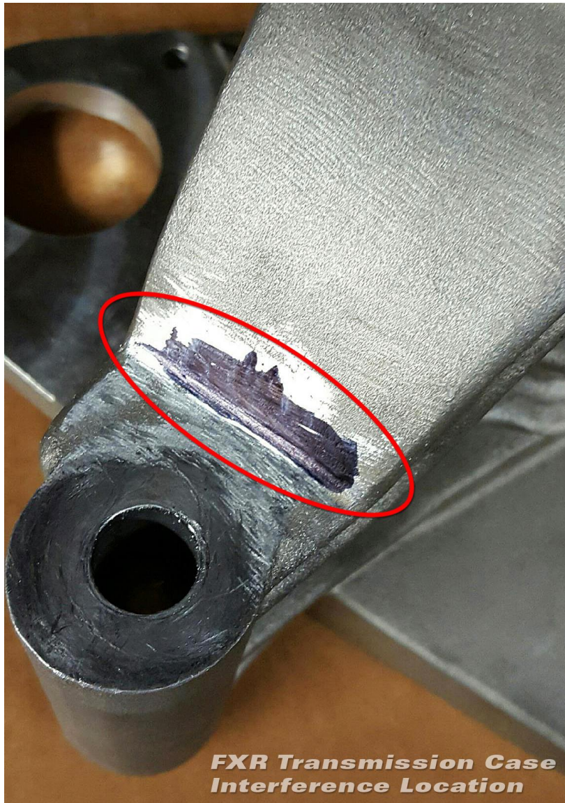
FXR Transmission Case Interference Location

Attention Harley-Davidson® FXR owners: Before installation the Performance FXR Swingarm, check for potential transmission case interference issues (shown in black marker in the image below,) especially when using aftermarket transmission cases. Clearance cases as required.