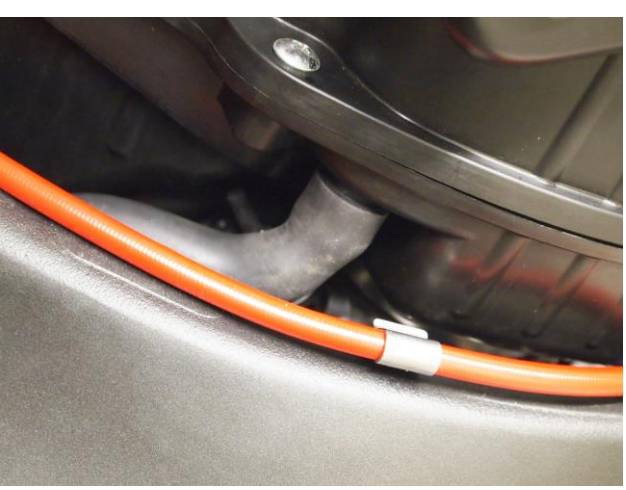
ALL BROCK'S PERFORMANCE PRODUCTS ARE DESIGNED FOR CLOSED-COURSE RACETRACK USE ONLY!

For more information on Brock's Performance Warranty and Terms and Conditions: BrocksPerformance.com > Brock's Support > Customer Service > Terms and Conditions For Questions and Comments: