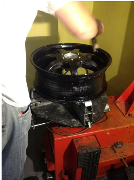
Fig 3: Apply soapy solution to rim lip