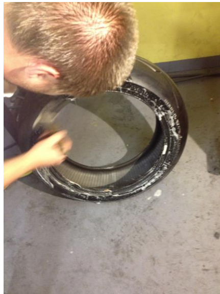
Fig 4: Apply soapy solution to tyre walls.

Step 3: After placing the tyre onto the rim, place the foot of the tyre machine arm between 3 - 5 mm away from the lip of the wheel, in both the vertical and radial direction So that when the bead of the tyre starts applying a force to the foot, all of the force is taken up by the tyre machine arm and not the carbon wheel. The foot must not be in contact with the wheel during the tyre fitment process.