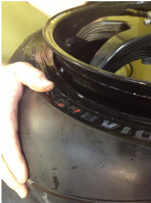
Figure 7: Keeping the tyre second tyre bead in the dip of the rim.

Step 5: Once the first tyre wall is fitted over the lip, you can repeat step 4 to slide the second tyre wall over the foot and the lip. It would prove easier to have two people to complete this step in order to keep majority of the tyre bead in the dip of the rim to make it easier to fit the tyre. As in step 4 if the tyre or the rim begin to slip reverse the direction and reposition the tyre bead in the dip of the rim. If the tyre falls off of the foot reverse the bed rotation and relocate the tyre over the foot of the arm.