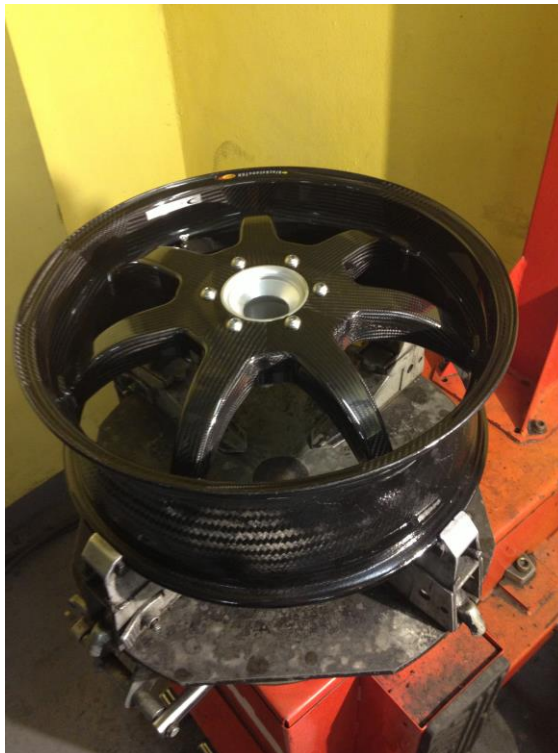
Figure 1: Wheel in the tyre machine jaws

Step 1: Place the tyre into the jaws of the tyre fitting machine with the spokes facing upwards, as indicated by the image below, this position is required in order to have the shortest distance from the dip of the rim profile to the edge of the lip.